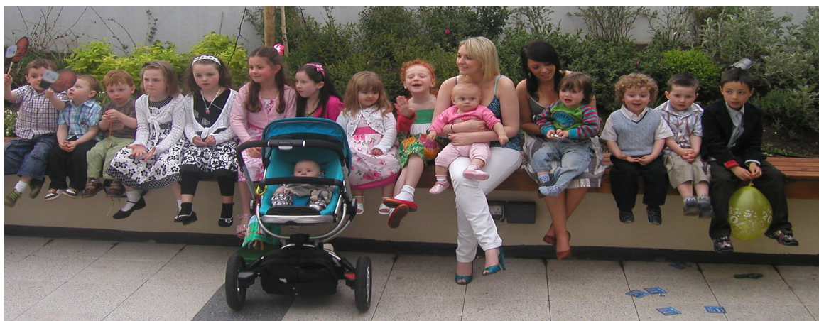
Big smiles. 6 th Generation Lallys