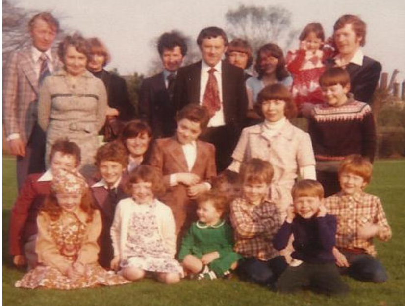
Group photo Circa late 1970's

25. SUSAN5 TIERNEY (MAI4 LALLY, THOMAS3, WILLIAM2, LAWRENCE1) was born 13 Jun 1969 in Mount bellew Galway. She married MATTEW CLARKE Dec 2001 in London, England..