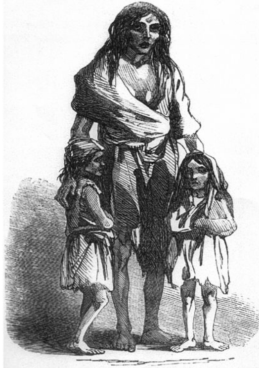
This famous image of an Irish mother with her two girls during the famine from The Illustrated London News

In stories recorded from the survivors we learn that Galway was devastated. One priest told of being on his way to say a morning mass in Kilascobe Church and having to stop to anoint 19 people whom he passed dying on the side of the road. Another story recounted the Landlord asking one of his tenants how quickly his people were dying, and when told that they were all dying within weeks of each other, he said, "Good." In the years that followed over a half a million families in rural Ireland were forcibly evicted from their homes.