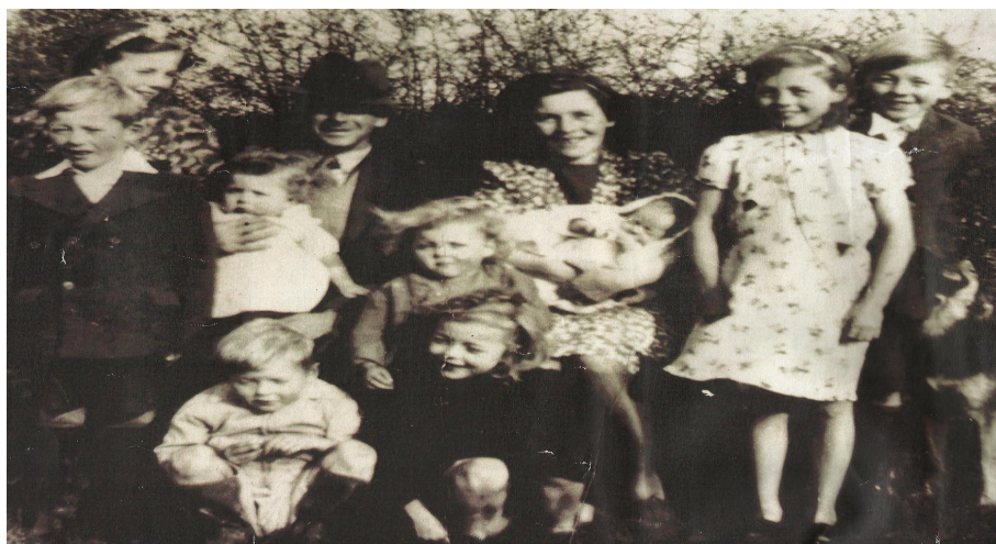
Family photo, Taken late 1947, showing off the arrival of baby Vincent.

A wave of emigration to England took place between the 1930s and 1960s by Irish escaping poor economic conditions following the establishment of the Irish Free State. This was furthered by the severe labour shortage in Britain during the mid-20th century, which depended largely on Irish immigrants to work in the areas of construction and domestic labour.