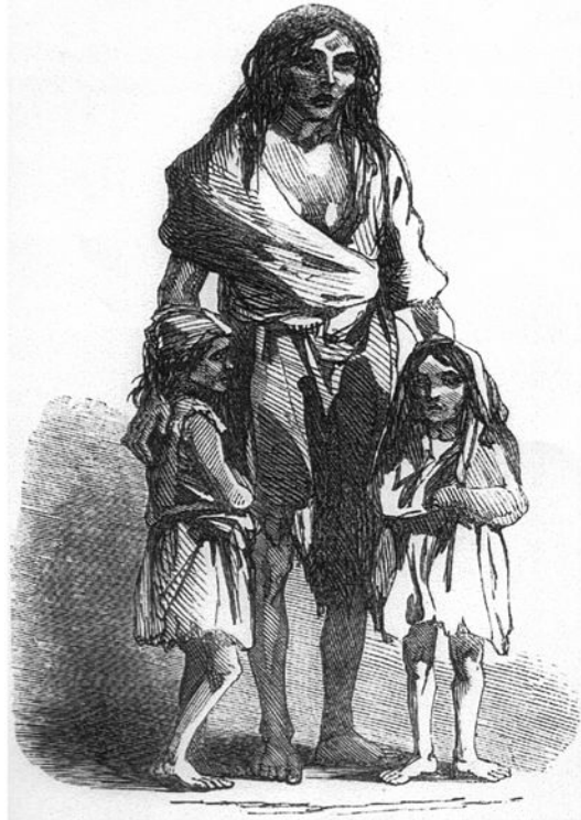
This famous image of an Irish mother with her two girls during the famine from The Illustrated London News

In stories recorded from the survivors we learn that Galway was devastated. One priest told of being on his way to say a morning mass in Killascoke Church and having to stop to anoint 19 people whom he passed dying on the side of the road. Another story recounted the Landlord asking one of his tenants how quickly his people were dying, and when told that they were all dying within weeks of each other, he said, "Good." In the years that followed over a half a million families in rural Ireland were forcibly evicted from their homes.