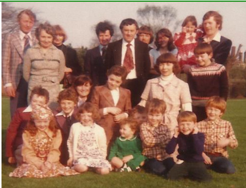
Group photo Circa late 1970's

25. SUSAN5 TIERNEY (MAI4 LALLY, THOMAS3, WILLIAM2, LAWRENCE1) was born 13 Jun 1969 in Mount bellew Galway. She married MATTEW CLARKE Dec 2001 in London, England..