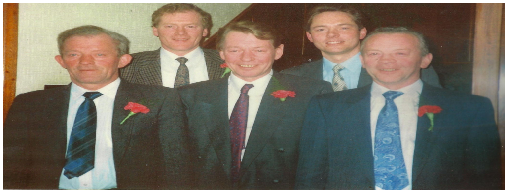
Looking well, all the boys at a family wedding.