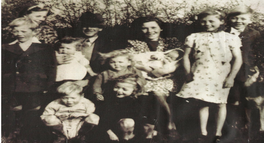
Family photo, Taken late 1947, showing off the arrival of baby Vincent.

A wave of emigration to England took place between the 1930s and 1960s by Irish escaping poor economic conditions following the establishment of the Irish Free State. This was furthered by the severe labour shortage in Britain during the mid-20th century, which depended largely on Irish immigrants to work in the areas of construction and domestic labour.